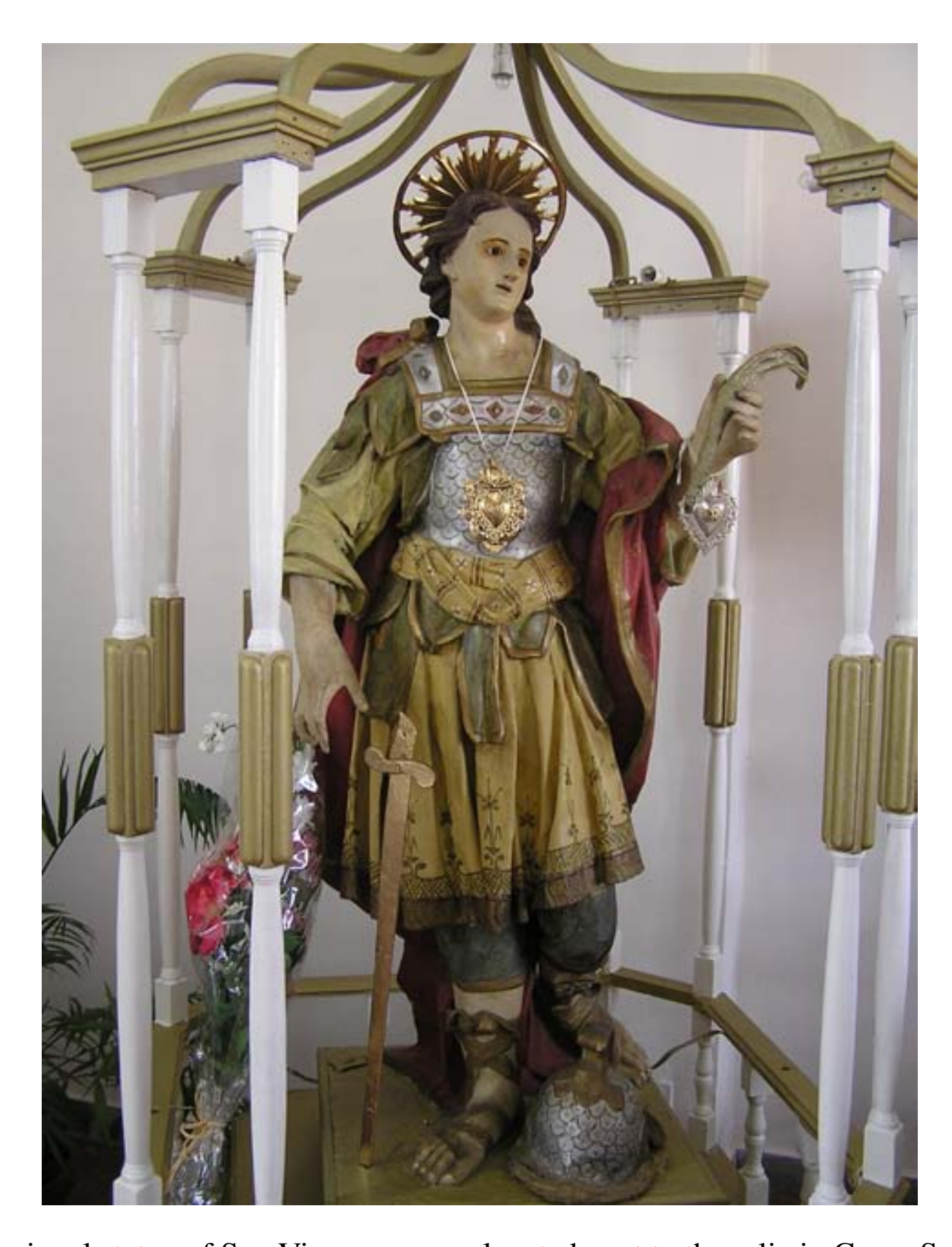
The processional statue of San Vincenzo, now located next to the relic in Craco Sant'Angelo.