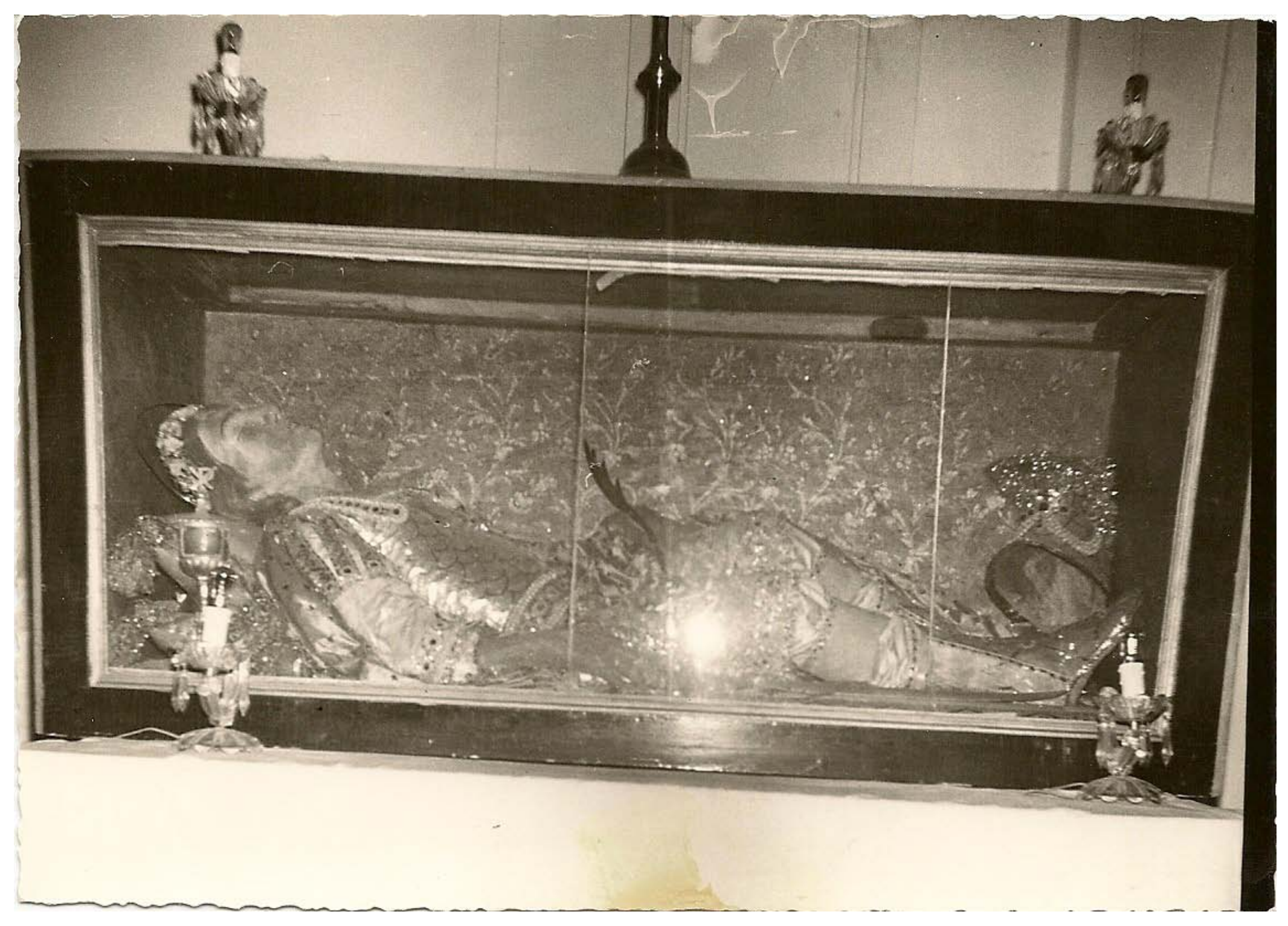
This photograph was taken in 1963 in the Capella di San Pietro, which was located alongside the Monastery of the Order of Observant Friars in Craco Vecchio.