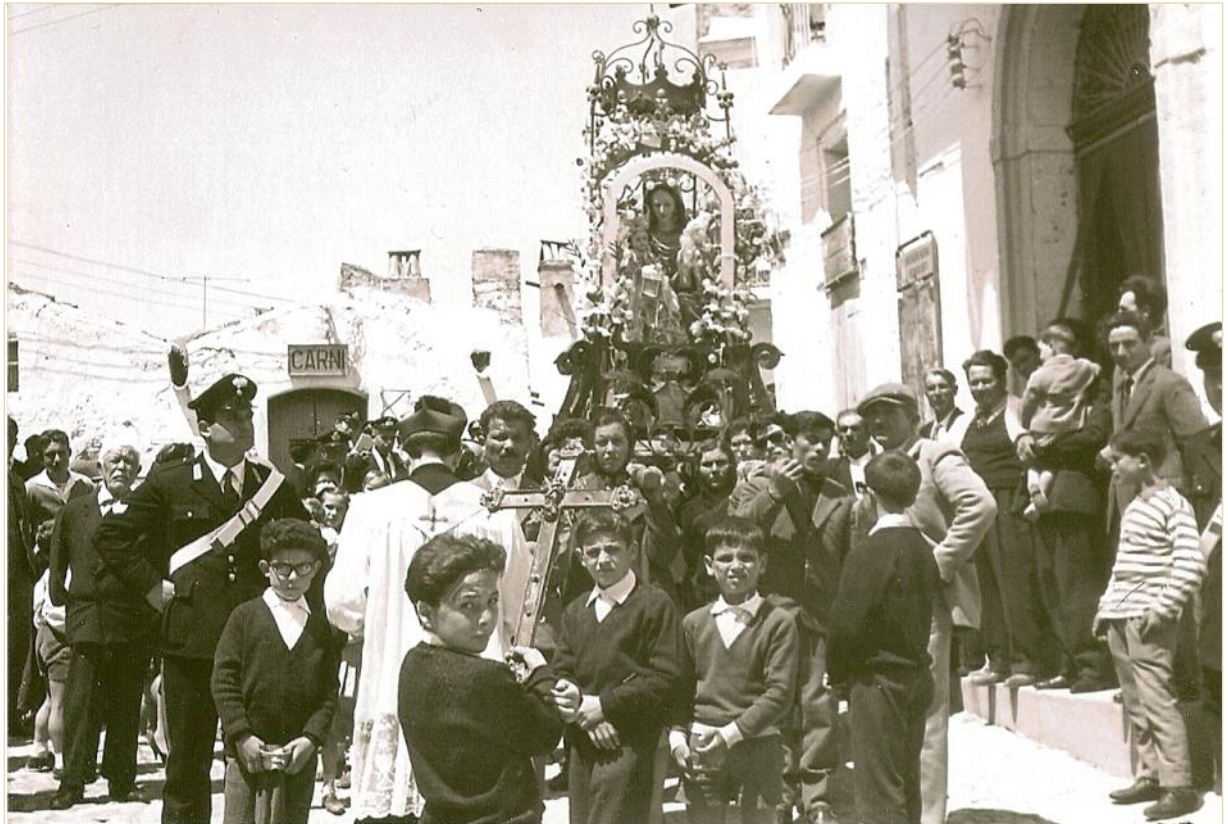
Madonna della Stella Procession - The 1962 Madonna della Stella procession in Craco Vecchio.

The month of May was a very significant and active time in Craco Vecchio. Following the church calendar, and centuries of tradition, on the first weekend in May they celebrated feast days for San Nicola and the Madonna della Stella, starting with a “processione” for San Nicola on the Saturday.