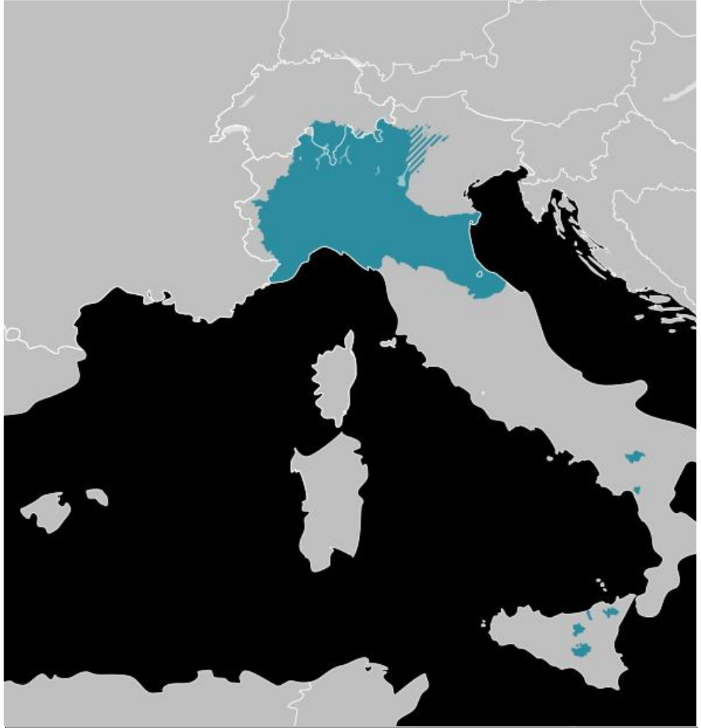
Geographic distribution of Gallo-Italic varieties

Here is the link to the wiki page about the dialects he is investigating.