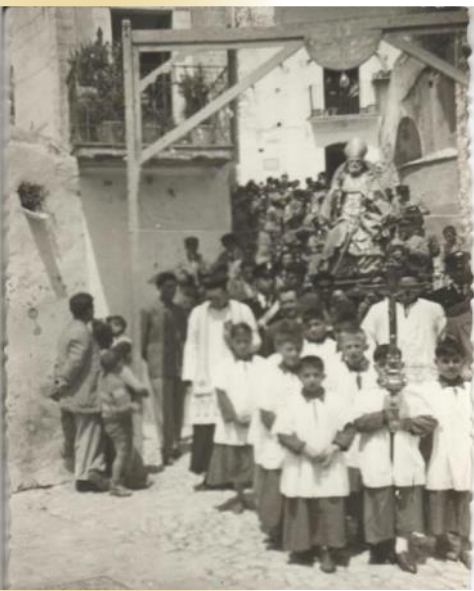
San Nicola Procession —The Saturday San Nicola procession as it enters the piazza.

The people also started preparing for the arrival of hired farm hands that came from as far away as Lecce to assist with the grain harvest.