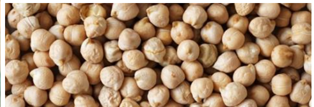
A Winter Treat —shown above are dry ceci beans (also known in English as chickpeas or garbanzo beans) that could be preserved and used in many ways. High in protein they help provide nutrition when fresh food was limited.