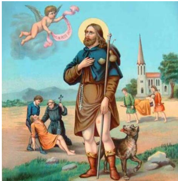
A Classic Image —shown above is a statue of San Rocco depicting him in a characteristic pose showing the sign of the plague and accompanied by his faithful dog.

After Ferragosto, many people from Craco would walk to the neighboring town of Pisticci to celebrate the feast of San Rocco there.