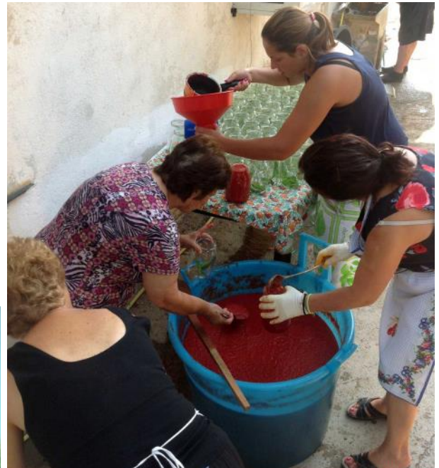
A Labor of Love —the wonderful bounty of August was enjoyed fresh but also preserved. In the photo above tomatoes are being cooked to preserve for later months.