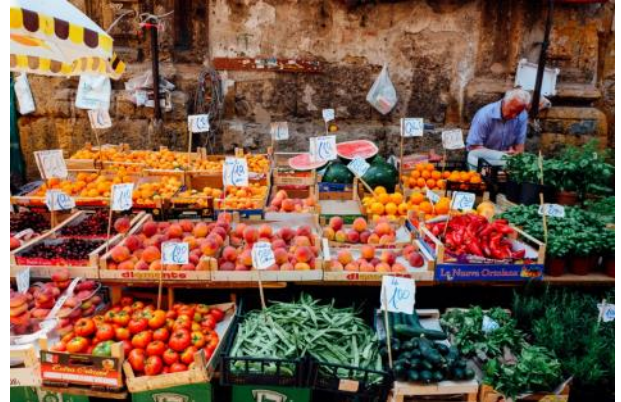
Fruits of Labor —pictured above are the typical fresh vegetables that were available in Craco during August.