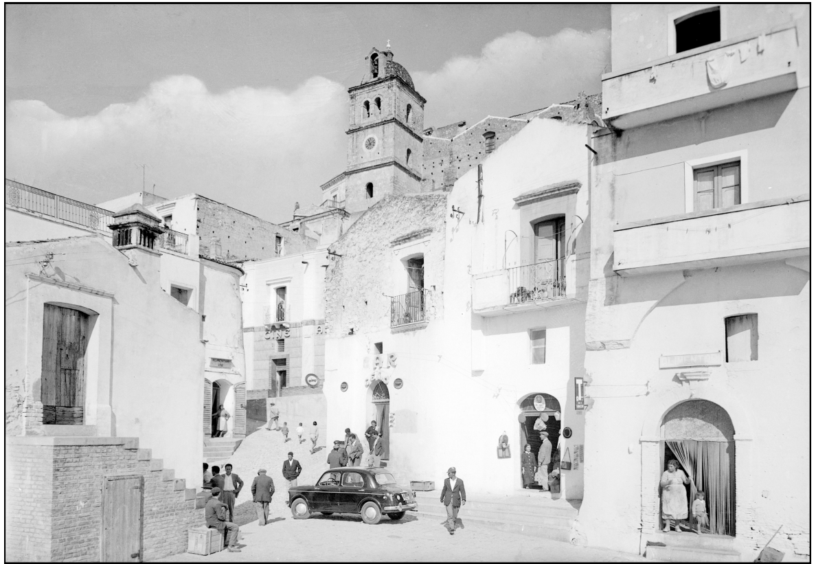
Center large photo (above CINE): The open doorway above the cinema entrance