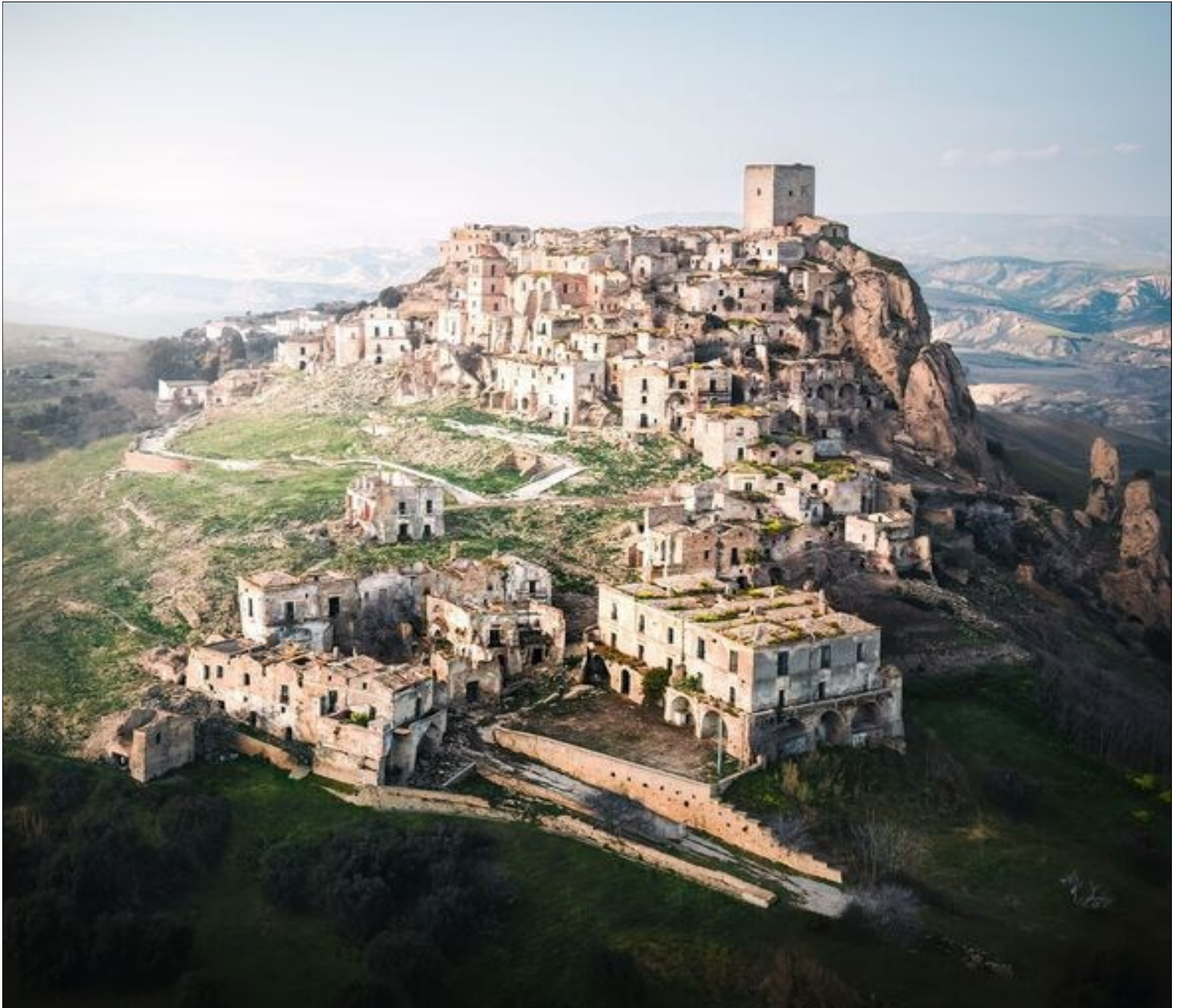
Craco — "The abandoned Italian 'ghost town' carved into a rock..."