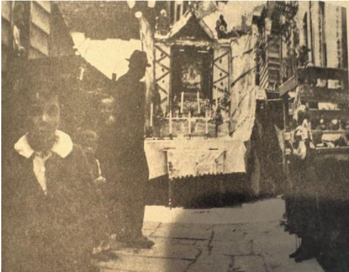
Riis Photograph St. Rocco Celebration 1894

What is interesting is that this is the exact same alley as the 1888 photo. It is even taken from the same camera's perspective. Riis identifies the festival as a Basilicata community based religious celebration. The photo demonstrates the remarkable transformation of both the alley and the general appearance of the people. While they may still be poor the joy, devotion and pride of the people is on full display in the 1892 photo. Gone is the sense of "ominous foreboding" replaced by bright lights and children dressed in their Sunday finest. Also gone, although I suspect only out of sight, is the intimidating presence of armed protection. Even the police noted that during most of its history, the Five Points was not a place where people of means, or women could roam without being accosted. Once the Italians began to dominate the neighborhood women and children could roam freely within their community without fear. Random acts of violence and petty street crime began to vanish.