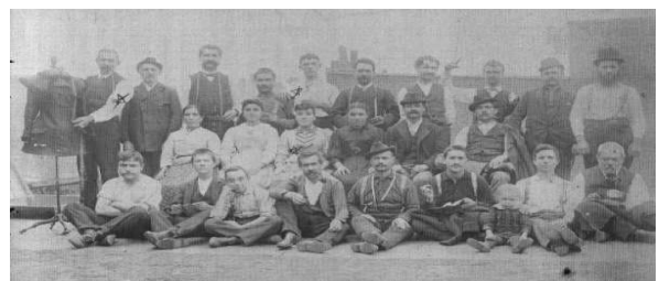
See who these immigrants from Craco were on page 3

These gains enabled the next wave of immigrants arriving in the next decade to become the largest group immigrating from Craco. ■