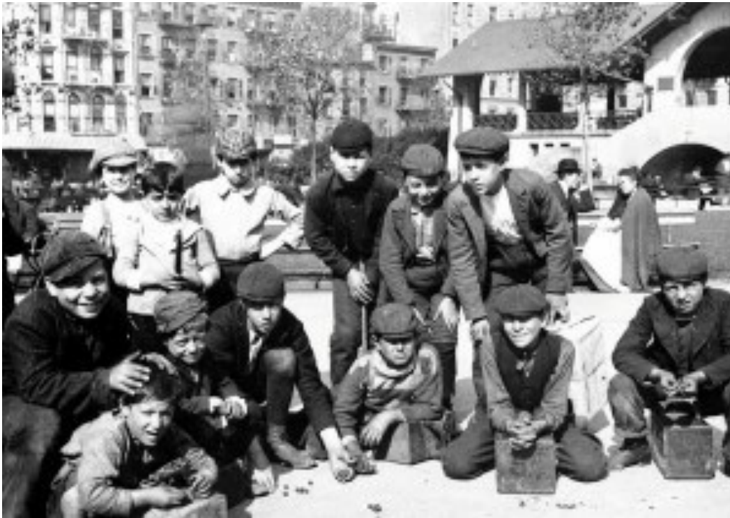
Italian shoe-shine boys in Columbus Park — Then called Paradise Park in Little Italy, many of them probably lived in the tenement buildings in the background which were on Baxter St., the area that housed so many Cracotans.