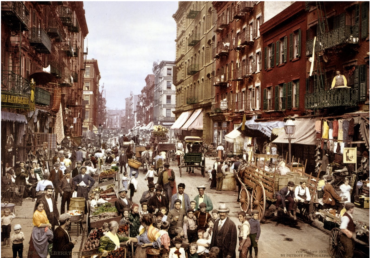
Manhattan's Little Italy —this 1905 photo taken on Mulberry St., shows the vibrancy and concentration of the immigrants living in this ethnic enclave. The pushcart vendors were common in this era and provided income opportunities for many Crachesi. The streets were now paved and gaslights are visible on the sidewalks showing the improvements in conditions. However, the tenement buildings, although newer, still were crowded and densely populated.

Note: names are listed, including those with mis-spelling, so they can be found on the Ellis Island website using the incorrectly spelled name to access the actual manifest, the errors are in their database and must be used to get to the record. ■