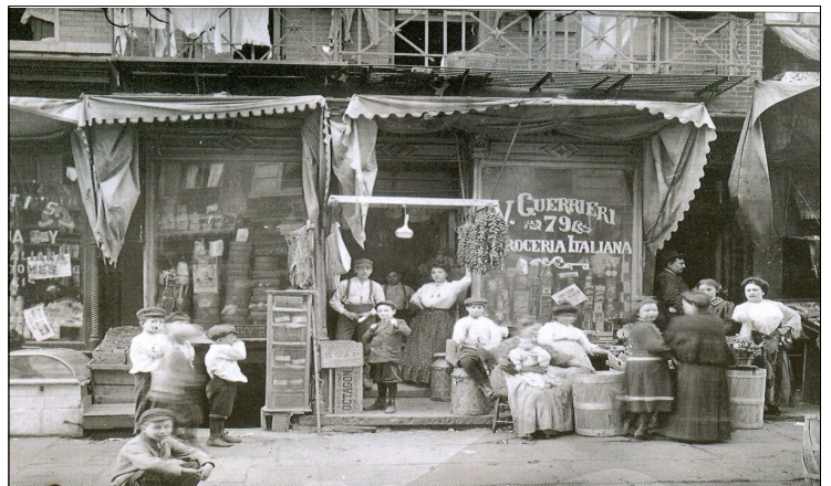
Italian groceries and specialty stores were important since staples from farms were no longer possible to make in New York as immigrants became laborers instead of farming.

Immigrant families were presented with new possibilities. Children were required to attend school. Once exposed to this environment, filled with other nationalities and cultures, children became more worldly than would have been possible at home. As they learned they acquired the English language of their new home while retaining the dialect of their parents. Now with a foot in both worlds, they used the solid foundation provided by their background to take advantage of the opportunities and growth available to them in America. ■