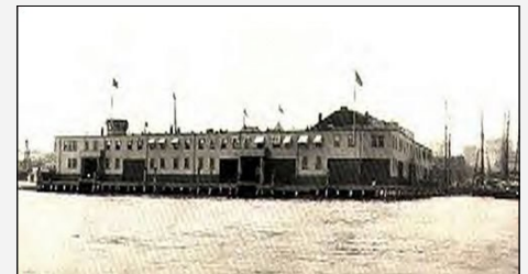
Boston Immigration Station, c. 1904