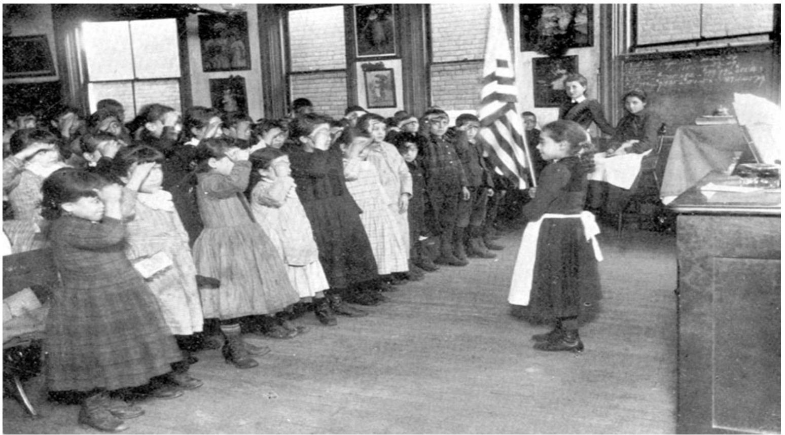
Education —Italian immigrant school children are shown in the photograph above. The school system was the most important aspect in the assimilation process as students acquired skills and knowledge allowing them to compete in their new home. They were also able to help their parents with their new skills in language and understanding of American culture.