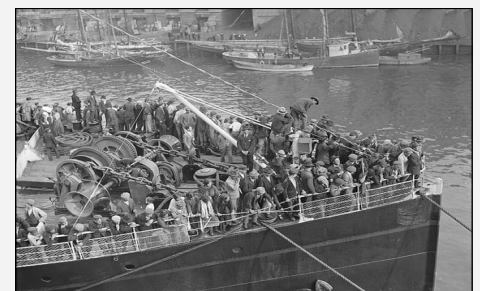
Immigrants arriving in Boston