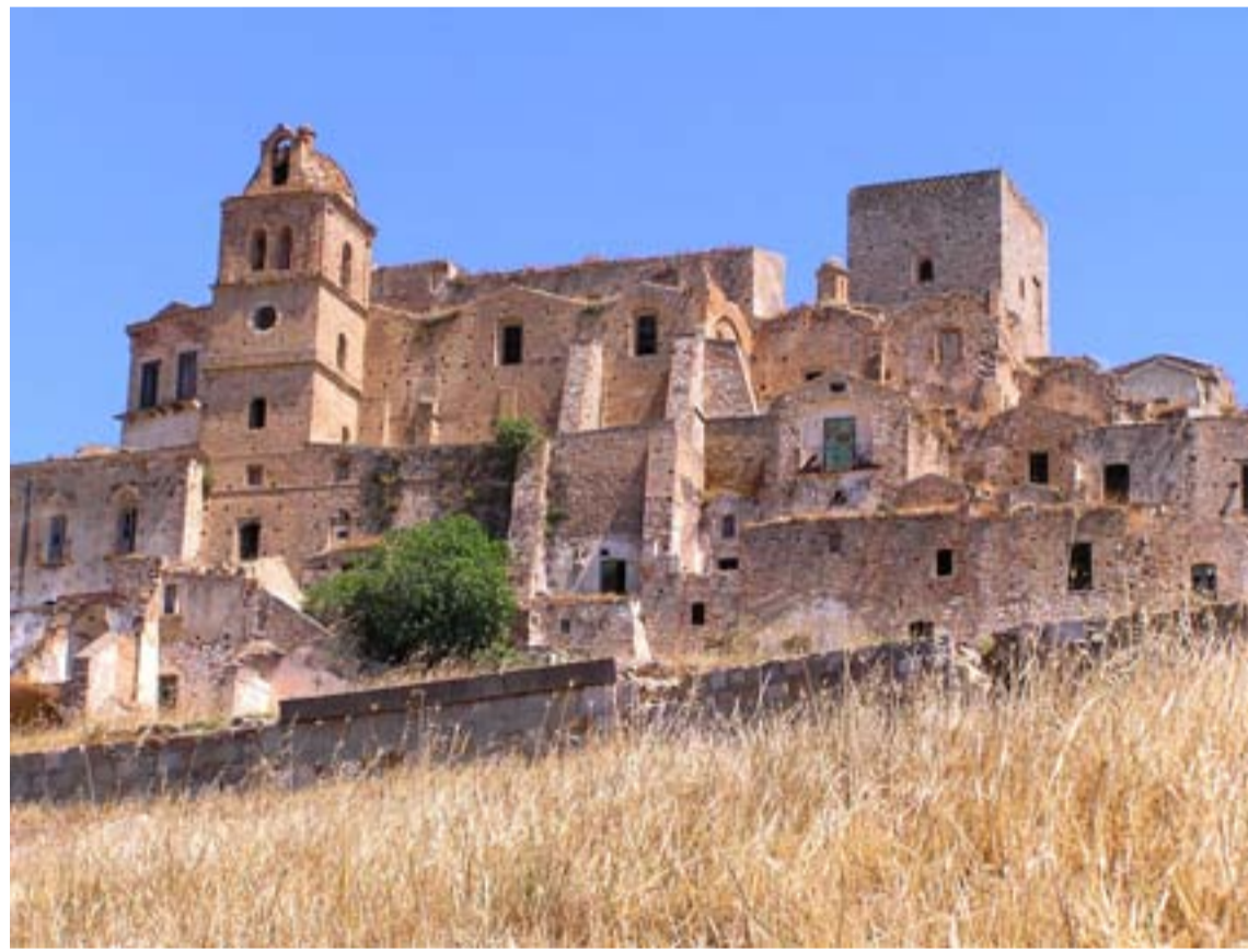
Two views from Largo Vittorio Emanuele II. From the early 1960's, and today, from where it once stood proudly.